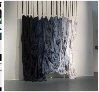
Leah Virsik "Further Together", 2015 34 denim jeans, a gi pant, straps and hardware 17' x 10' x 1'