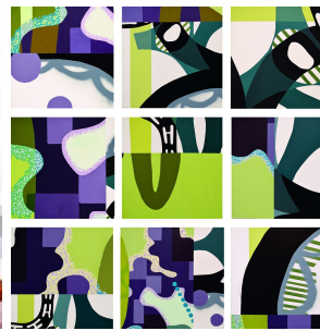
Nash Bellows "Oh, OH or OH! Is an Interjection, Proclaiming Surprise" 2015. Acrylic and Spray paint. 9' x 9'